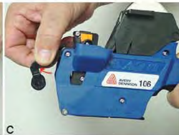
C Slide the ink roller from the holder