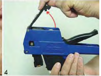
4 Open bottom cover