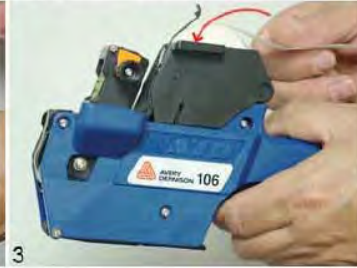
3 Close label loading gate