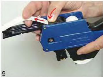
9 To close, press the platen; while pressing, pull label strip until it "clicks" & does not advance