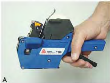
A Squeeze the handle