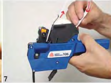
7 Feed the label strip through the body