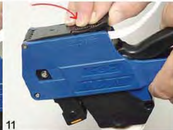
11 Close the bottom cover