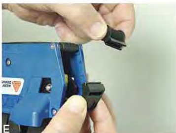
D Slide new ink roller onto the holder & release ink roller holder