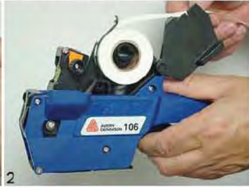
2 Insert roll on label roll holder