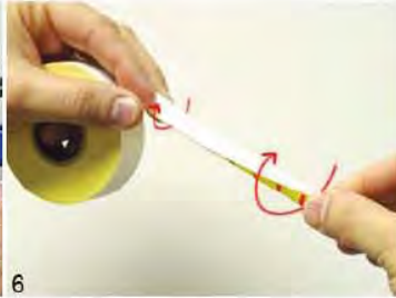
6 Straighten label roll for ease of loading