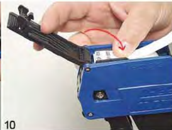
10 Squeeze handle couple of times while keeping platen pressed down & then fold back the label strip towards handle