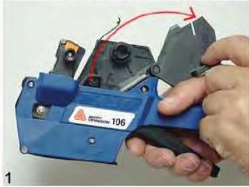
1 Open label loading gate